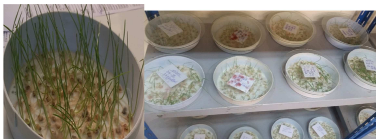
Figure 3. Some photos during germination.