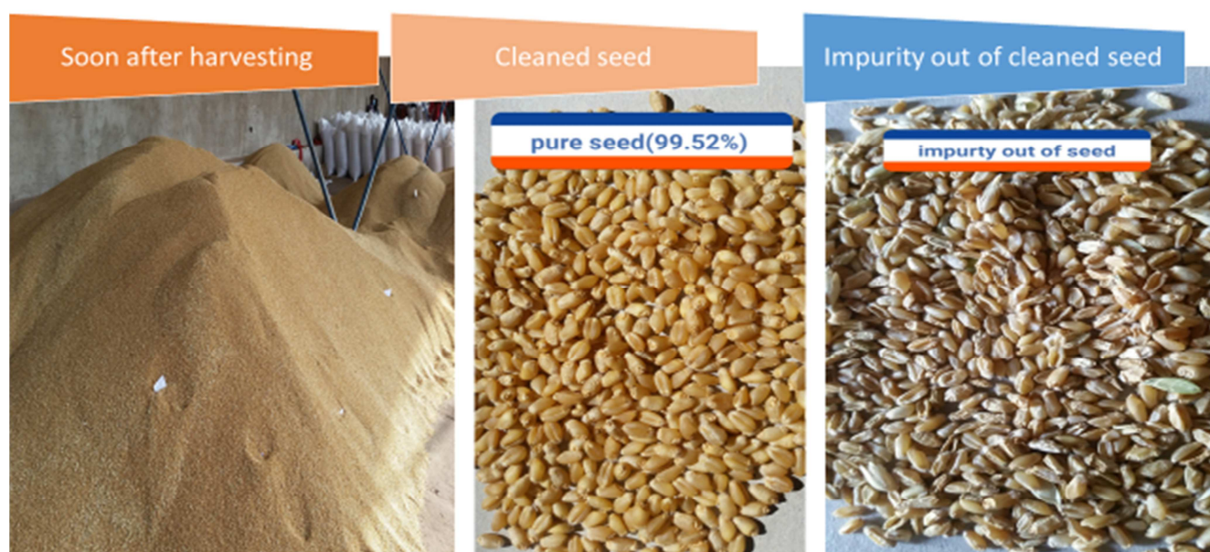
Figure 1. Seed cleaning process.

shorima (pb). The maximum Moisture content (13.01%) at storage was observed on Daka (br). Daka (br) with (95.25%) showed the highest germination potential followed by Hidase (pb) with (93.63%) of normal Germination while wane (br) with (87.41%) showed the lowest germination. Generally all the variety was accepted for distribution of the seeds as they fit required seed quality parameters. According to Kizilgeci et al. (2017) germination of seed can be affected by environment where it produced [16, 13]. Thousand seed weight of the variety may be affected by where they grow and genetic potential of the variety according to Negash Geleta et al. [15].